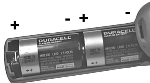
Figure 1. Properly Installed Alkaline Batteries

NOTE: Dispose of depleted alkaline batteries according to applicable state and local regulations. In the absence of such regulations, recycle and/or dispose of batteries through voluntary waste recycling programs.