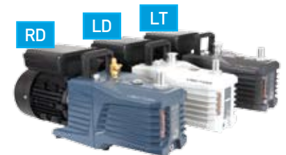
Vector RD also available for commercial refrigeration applications